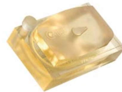
*See Objet Hearing Aid brochure